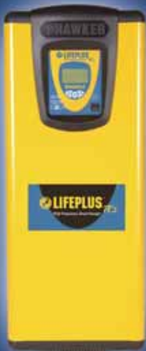
LIFEPLUS® TC3 - First in the Business... Best in the Business