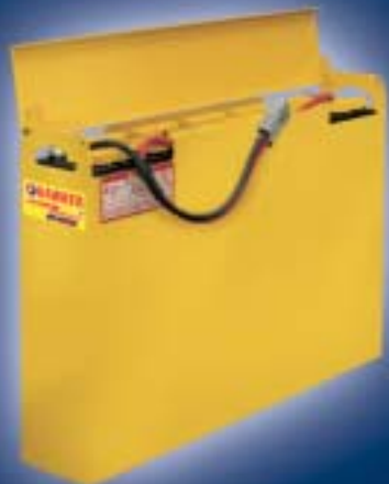
TOP POWER® - The Affordable Power Source